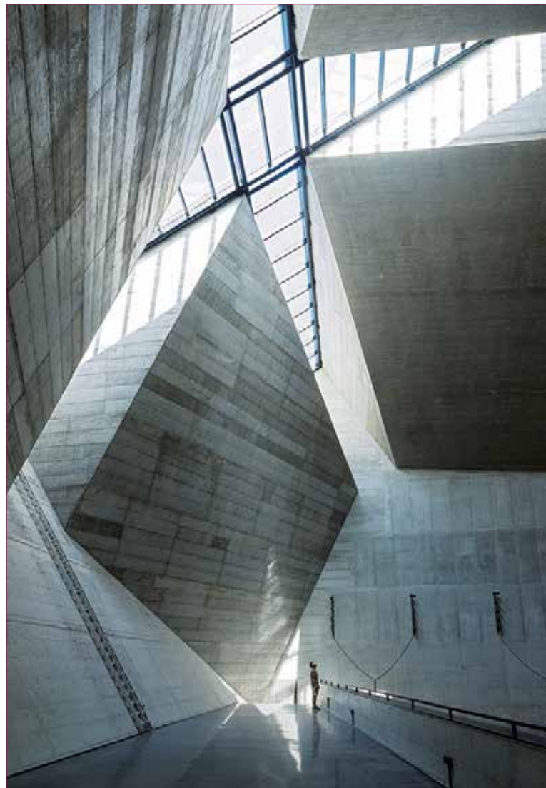
Fig. 2 - Sambuceto.

of this theoretical perspective become particularly evident in the work of Luisa Bonesio and Alberto Magnaghi. Although their intellectual trajectories differ, their approaches complement each other remarkably well, as both redefine landscape as an intensive locus and collective project. Bonesio, a geophilosopher, emphasizes the embodied dimension of dwelling. Her conceptualization of landscape rejects both narrow localism and functionalist abstraction. For Bonesio, landscape is neither seen nor contemplated as a picture but traversed, lived, inhabited,