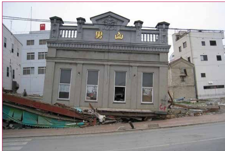
Fig. 4 - Collapse of the shop building of Otokoyama.

In 2011, the Great East Japan Earthquake brought a catastrophe to a wide area of Eastern Japan. Not only strong