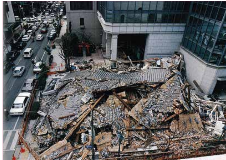
Fig. 3 - Collapse of the building No. 15 of the former settlement in Kobe (Source: Report on the restoration of No.15 building in the former settlement of Kobe: Important Cultural Property).

As described above, before the modern times, countermeasures mitigating earthquake damage had been performed