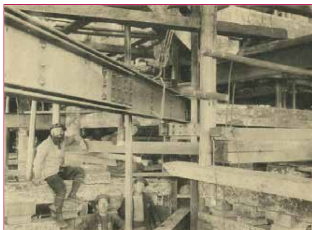
Fig. 2 - Reinforcement of Nandaimon of Todai-ji (Source: Report on the restoration of Todaiji Nandaimon: National Treasure).

The former building of Kodo of To-ji mentioned above was added some reinforcing horizontal beams after earthquakes in 1362.