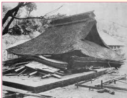
Fig. 1 - Collapse of Shariden of Enkaku-ji. (Source: Special report on the survey and restoration of Enkakuji Shariden: National Treasure).

This paper shows an overview of recent development of earthquake countermeasures on Japanese heritage buildings, which are mostly wooden buildings, and the paper also introduces its past history in order to provide the background.