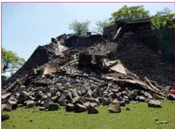
Fig. 5 - Collapse of Kumamoto castle.

quakes, but also a big tsunami struck heritage buildings. The number of damaged heritage buildings, including 116 Important Cultural Property buildings and 438 Registered Cultural Property buildings, became considerable.