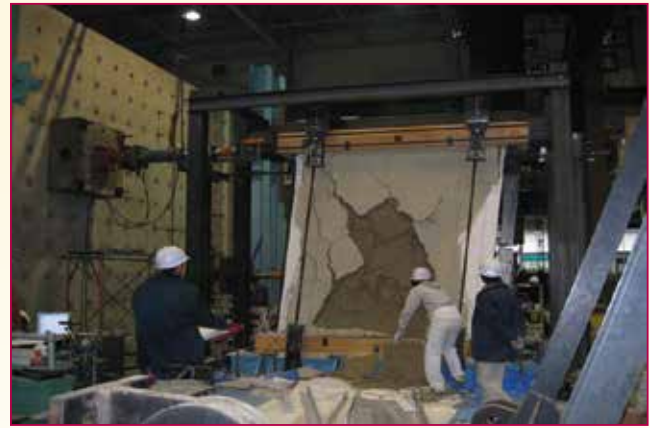
Fig. 8 - Experiments of earthen wall of Himeji castle.

sufficient data for the analytical model. It is also effective to examine a result of analysis by comparing it with a record of past earthquake damage.