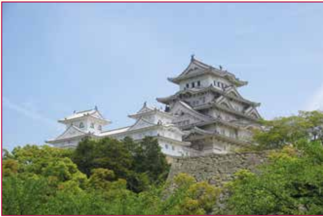
Fig. 7 - Himeji castle (Source: Shuji Kato, a conservation architect).