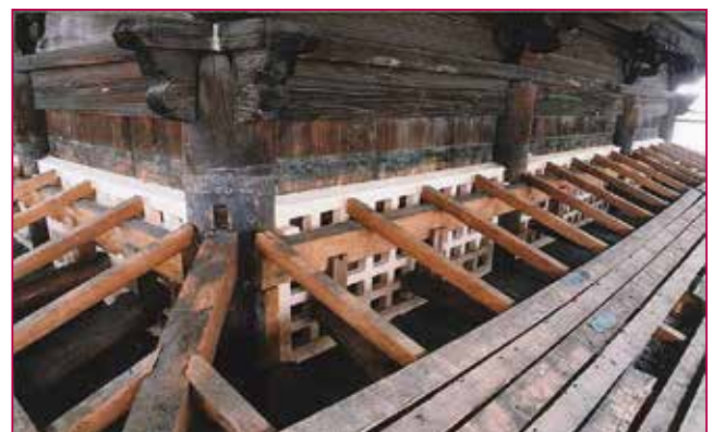
Fig. 10 - Reinforcement of Knanondo of Eiho-ji.

On the other hand, there are still some problems in Japan. One of them is a countermeasure on heritage brick build-