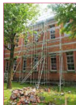
Fig. 6 - Dropping chimney of Kumamoto University building

Then, a numerical examination is conducted with a suitable analytical method and model. When needed, structural experiments with samples/models and non-destructive/slightly-destructive inspections on site are performed in order to get