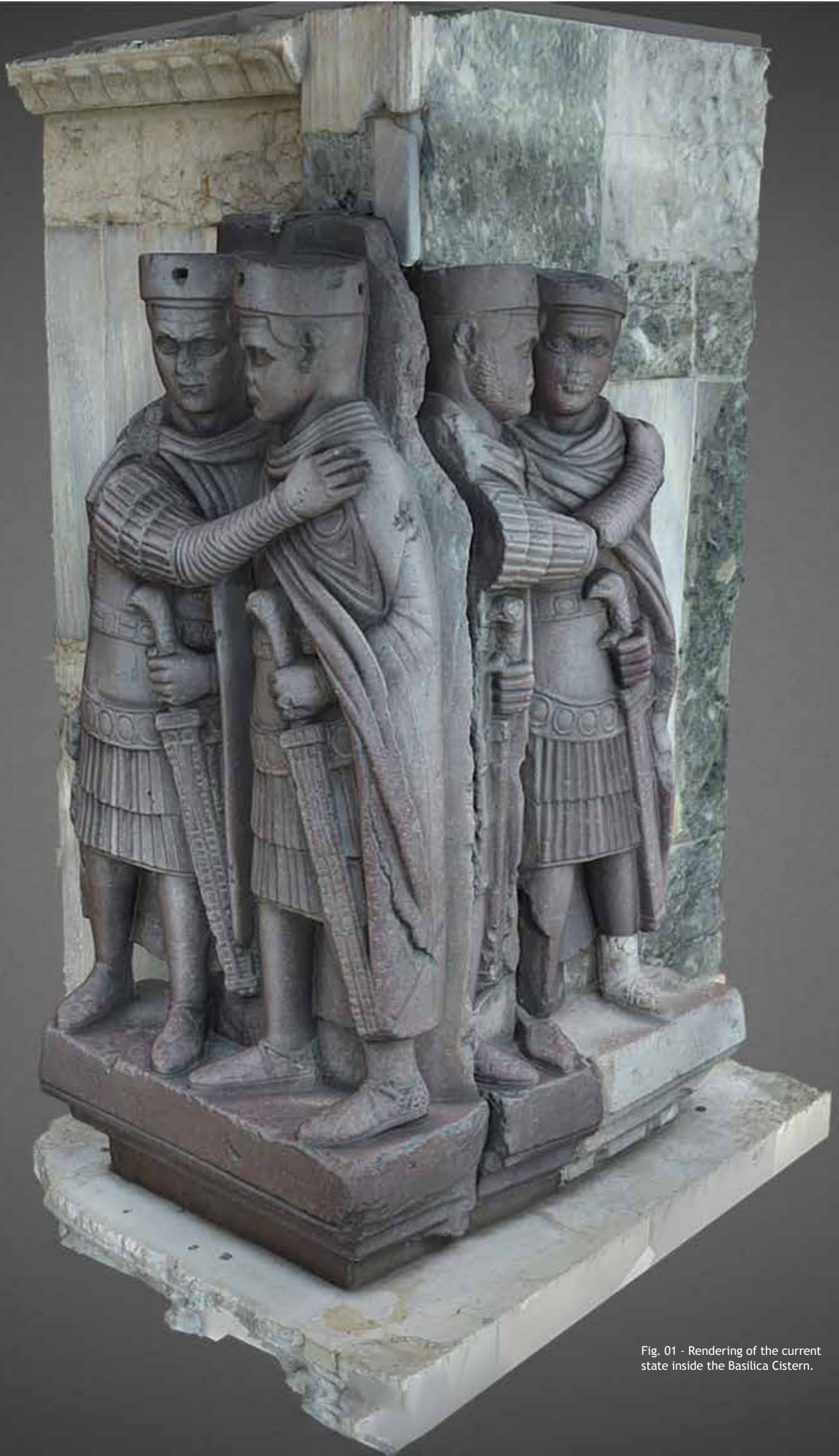
Fig. 01 - Rendering of the current state inside the Basilica Cistern.